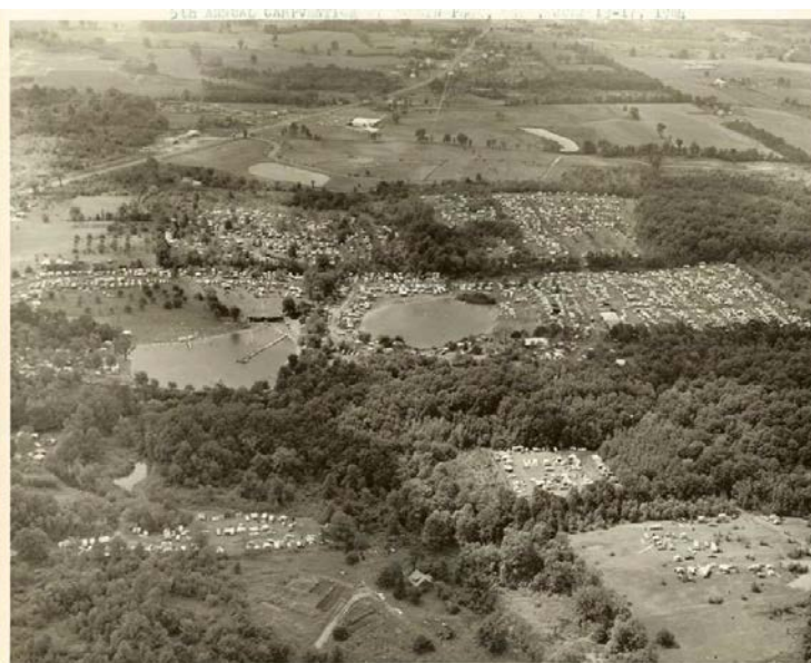
Aerial Photo of 1964

We had campfires back then, and our chapter was in charge of lighting the first campfire of the Campvention. We had worked up a skit where ‘space men’ came from outer space and helped us light our fire (very popular in 1964). Several of our chapter members were dressed as space men with outfits made of silver material and the paper 5-gallon ice cream buckets we used to get ice cream in painted silver and put over their heads. They had a whole skit about the space men coming to meet humans and at the appropriate time in the skit when one of the space men pointed his finger to the stack of wood, Dad was in a tree and pulled a string which tipped over some kind of liquid