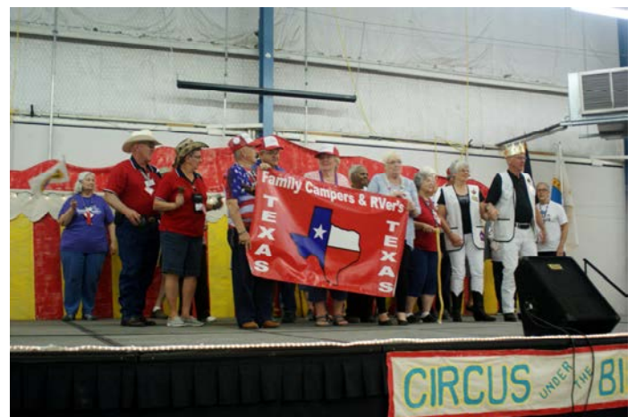
Rally opened with the International Parade

Instead of wrapping up the rally the last night with the International Parade of States, Provinces, and Specialty Chapters, it became the kick-off for 2017's opening. The enthusiastic parade was fol-