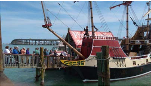
Winter Texans board the Black Dragon pirate ship

FCRV'S Winter Texan Chapter made up of members from various states and provinces in the U.S. and Canada who spend winters in the Rio Grande Valley of South Texas enjoyed activities in 2016-17. The group holds monthly luncheon meetings the 3 rd Tuesday each month from October thru March at a variety of restaurants. The January and February meetings are the largest gatherings. 102 people attended the February meeting at the Riverside Club Restaurant in Mission.