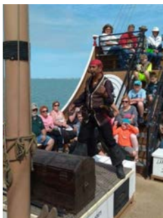
Captain and 'crew'

Activities in December included Tuba Christmas concert and Weslaco Christmas Parade. At the December meeting and Christmas Party $225 and 100 lbs. of food were donated to the Hidalgo County Food Bank. At the January meeting the group heard an informative presentation by Border Patrol and Customs Agents. Also in January there was a trolley tour of Hidalgo including a visit to the Pump House Museum and model train display. January also included an outing to the annual Veterans Benefit Show at Casa Del Sol RV Park. In February a 'hardy' group went aboard the Black Dragon Pirate Ship at Port Isabel for a fun cruise.