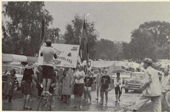
NEITHER RAIN nor sleet stops Piasa Ramblers Chapter (Illinois) from parading at Akron, Ohio, 1964 Campvention.