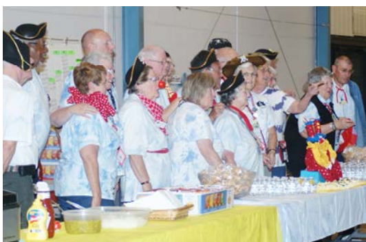
Ready to serve 'circus food' at the dance