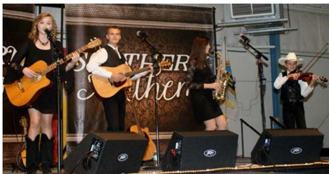
Southern Anthem did a great show spirit, Southern Anthem brought the stage to life with

Proving that music feeds the soul and lifts the