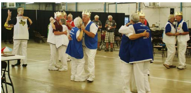
First dance to "Love Me Tender."