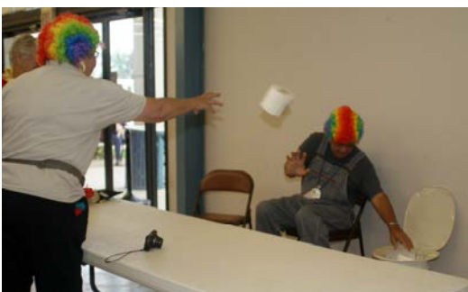
"Roll" toss was a popular carnival game.

Wednesday was the big day for free carnival