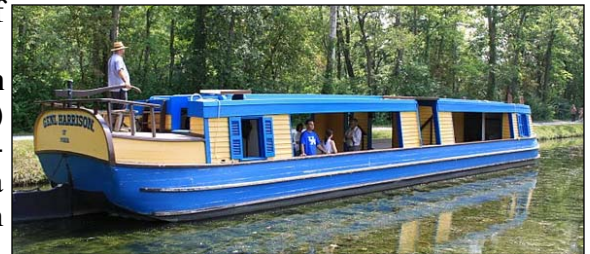
The General Harrison canal boat

About 40 miles south of Lima is the historical site of Johnston Farm & Indian Agency (9845 N Hardin Rd., Piqua, Ohio) where you can travel a small section of the Miami and Erie Canal aboard the General Harrison canal boat. It is a 70-foot replica canal boat like those used to transport passengers and goods in the 19 th century. The boat is pulled by mules along the towpath.