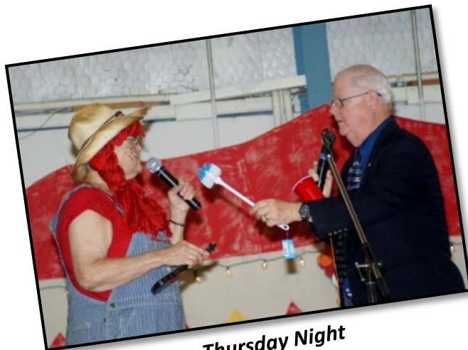
Thursday Night Variety Show