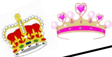
Saturday Night King & Queen Ball