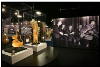
Graceland's new 200,000 square foot state of the art Entertainment and Exhibit Center Complex houses the world's largest Elvis museum

Where in world can you visit the home of the King of Rock n' Roll, stand in the recording studio that birthed the Million Dollar Quartet, tour the studio that pioneered the way for musicians of all backgrounds and color to record together, and visit the working studio of the GRAMMY winning producer behind a