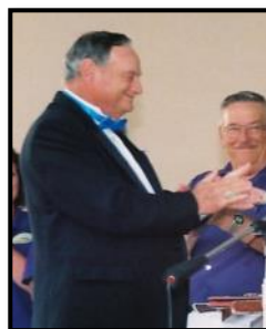
Gone but not forgotten