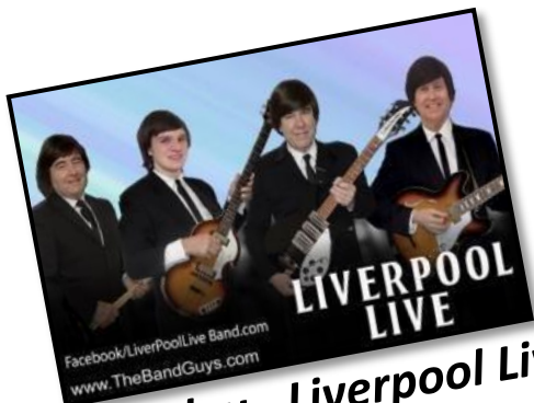
Tuesday - Liverpool Live