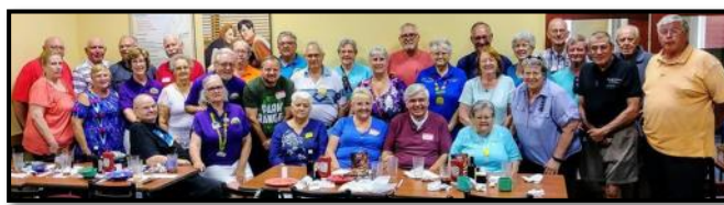
Mid-Florida Snowbirds gathered at the Golden Corral in Winter Haven

This has been a very rewarding project for our members as well as Ronald McDonald House.