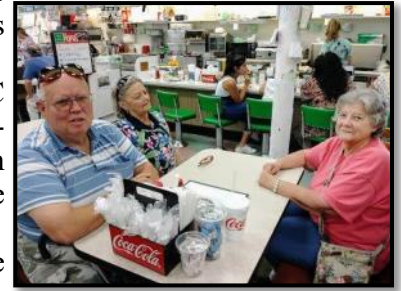
Drugstore lunch counter

Area attractions and area eateries completed Travalong 2018 with most of the attendees going on to Campvention in Doswell, VA to be volunteers. Another Travalong completed.