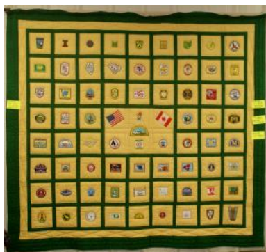
Many hands and many hours made this special quilt.