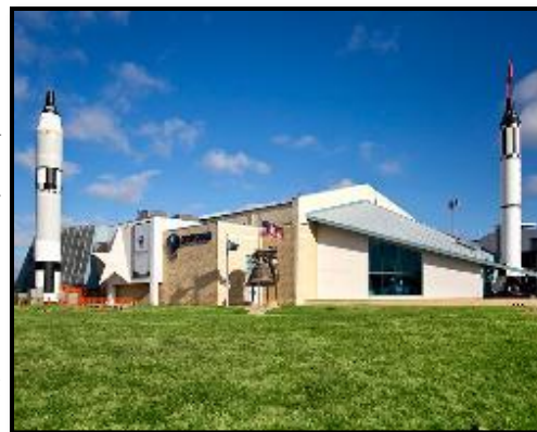
Campvention 2019 Cosmosphere