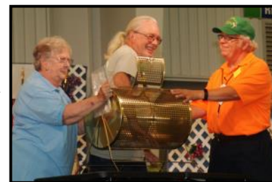
The moment all were waiting for.