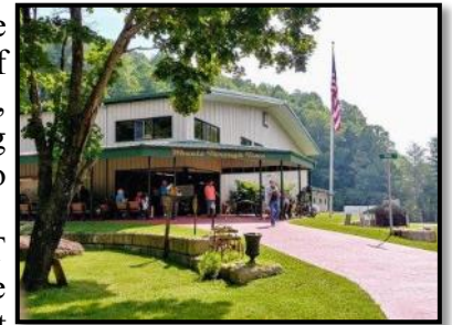
Wheels Through Time Museum

There are many sites to see and visit in the area. In addition to the WTT Museum above, the group toured the Elevated Mountain Distilling Co. The company is a craft distiller of top-shelf whiskey and spirits. Their hybrid pot and column still was custom built to meet their specifications to produce scotch, whiskey, and vodka using the natural water of Haywood County which has been used by moonshiners in the past.