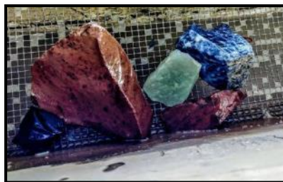
Maggie Valley Gem Mining Rock Shop

We enjoyed the Maggie Valley Gem Mining Rock Shop, even 'mining'. The buckets of sand, ore, and gems were 'salted' but still fun to wash out in the sluice.