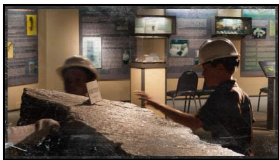
Campvention 2019 Strataca

♦ The Adult Activities Center plans to have hot coffee and donuts or rolls available to purchase early each morning so you don't have to drive to the donut shop. Stop in and visit them. They will be in the Centennial Hall Meeting Room with a nice-size room plus a kitchen area and restrooms just down the hall.