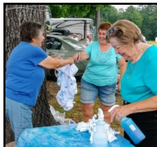
YARS make their own shirts by tie-dyeing white t-shirts