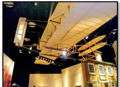
Wright Flyer Exhibit

Marbles Kids Museum allows children to imagine, discover, and learn through many interactive displays. With two retired elementary