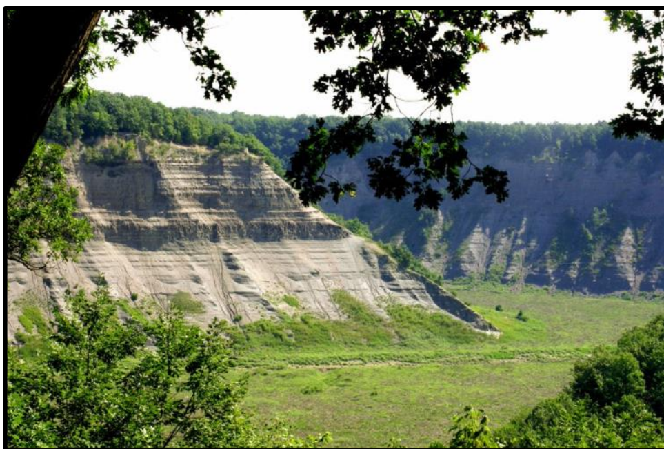
Letchworth State Park, NY Finger Lakes.... Page 11