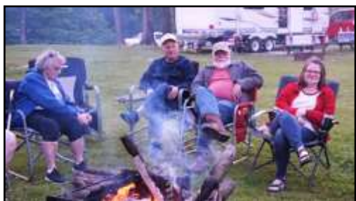
Enjoying a campfire