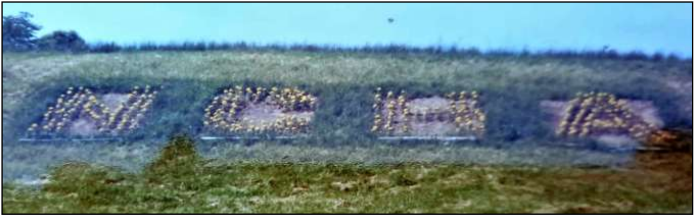
Lasting Monument to NCHA