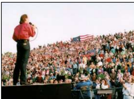
Lee Greenwood Campvention 1992

You will find the rest of the comments and other interesting posts on the Family Campers &RVers Face Book page. Also check the website at www.fcrv.org