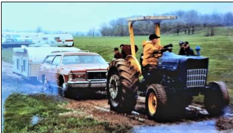
Mud, Mud, Mud