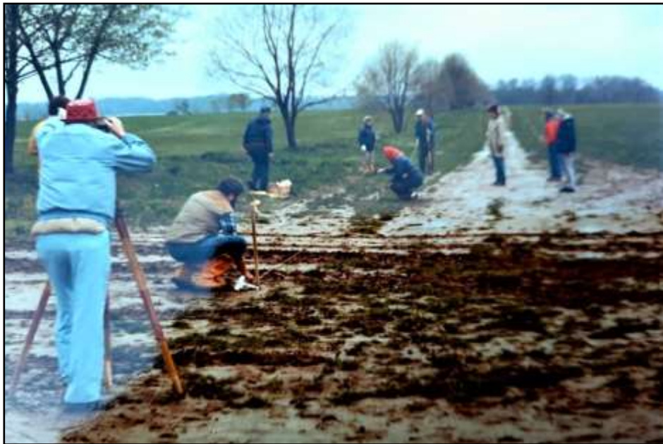
Prepping for Campvention