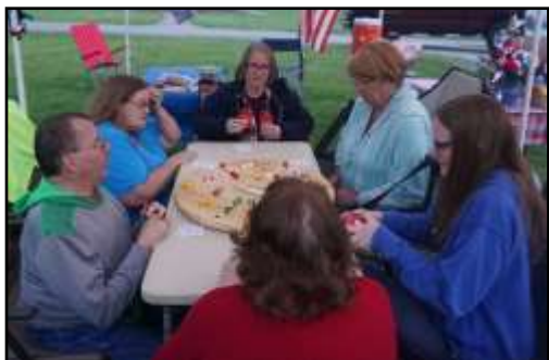
Adults enjoy a game