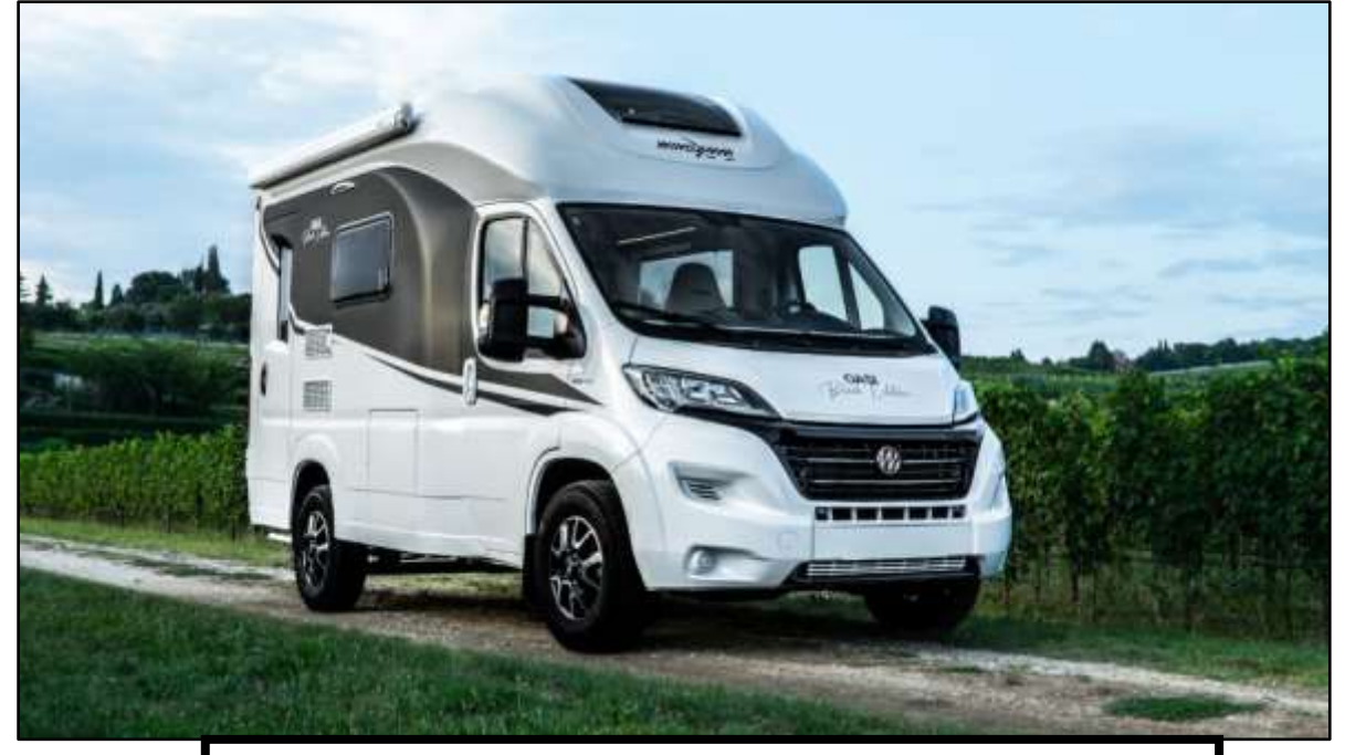
WINGAMM OASI 540....Page 27

Canadian Appreciation Weekend Coming Soon...Page 23