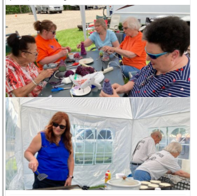
📫 10 🗰 1 🌧 2