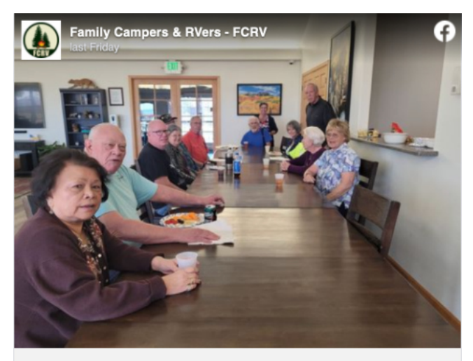
Colorado Road Runners met for a chapter potluck lunch and meeting at a members residence in April 2023.