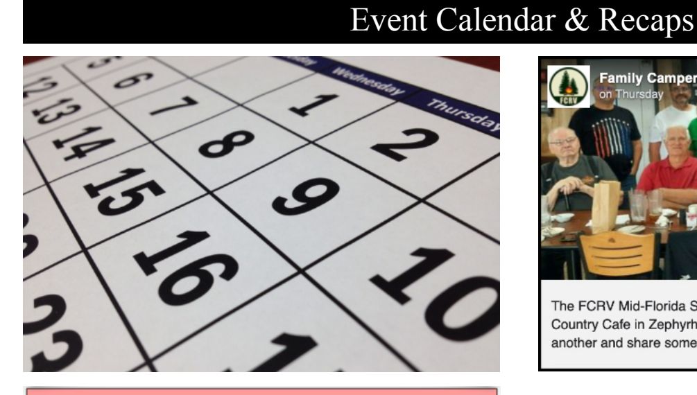
[Click Here For Full Event Calendar]

[Click here to submit a recap of your ent or outing]