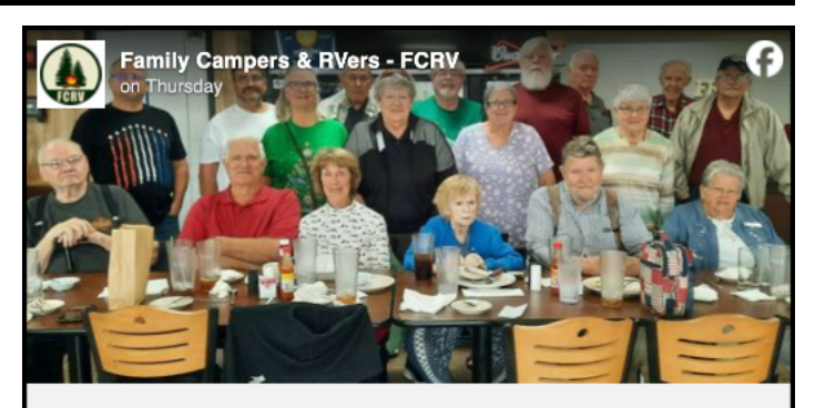
The FCRV Mid-Florida Snowbirds Chapter & friends gathered at Fresh Country Cafe in Zephyrhills today. It was a fun time to catch-up with one another and share some info! Food? Delicious!

[Click here to submit a recap of your ent or outing]